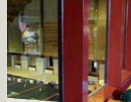
University swimming pool